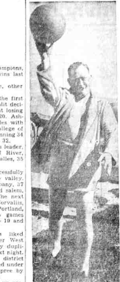
Brooklyn baseball boss Larry MacPhail frolics at Miami Beach and is active at Tropical Park.