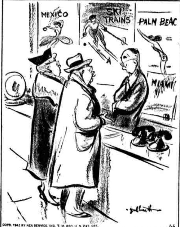
"Do you know a nice resort for plain people like us—some place where everybody doesn't have to be an athlete or a bathing beauty?"