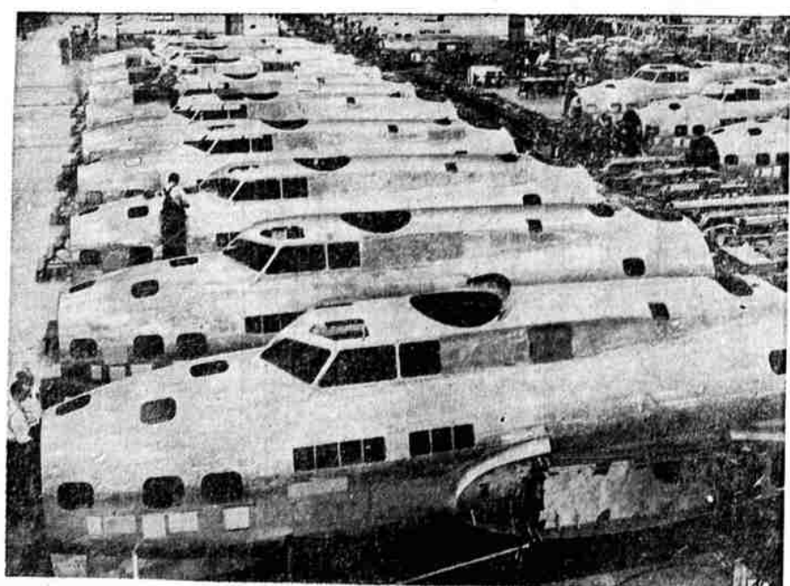
WARPLANE PRODUCTION LINE —Boeing Aircraft company released this picture of a heavy bomber production line at its Seattle plant, coincident with a statement the firm had beaten delivery schedules by 70 per cent in December. It said the announcement and photograph were approved by the war department.