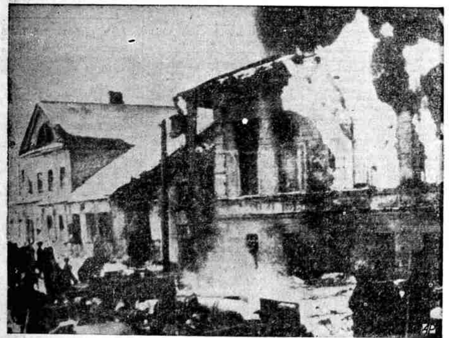
RUSSIANS TAKE KALININ —Flames sweep a building in Kalinin, Russia, as red army troops enter the city, recaptured from the Germans in Russian counter-offensive.