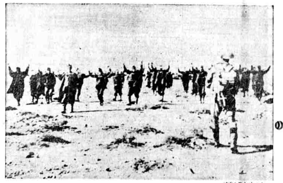
HAPPY ITALIAN PRISONERS —Hands raised and many waving white handkerchiefs, Italian soldiers trapped near Tobruk rush toward British lines to be taken prisoner. One lone British soldier in foreground greets them.