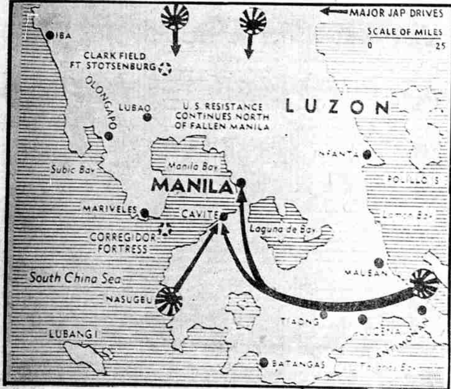
AFTER MANILA'S FALL —Here is the new scene of battle in the Philippines following the fall of Manila, with Cavite evacuated but American and Philippine troops fighting on north of the city.