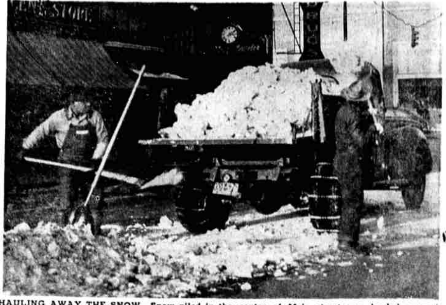
HAULING AWAY THE SNOW —Snow piled in the center of Main street was hauled away in trucks Friday, clearing the streets. This picture shows a truck being filled with snow at Ninth and Main streets.