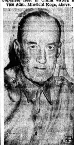
SECRETS-Proof of Uncle Sam's increasing vigilance about details which might serve an details which might serve an enemy's purpose is this picture of Maj. Gen. William E. Shedd, who commands the Panama coast artillery. Army censor deleted background, possibly of maps.