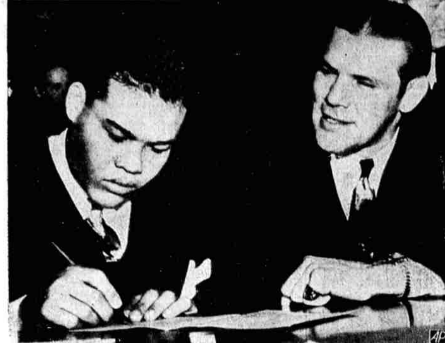
Buddy Baer (right), to be held in Madison Square Garden, January 9. Proceeds will go to the navy relief fund.