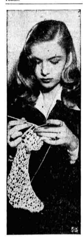
BUSY—Between scenes on a movie lot in Hollywood, Veronica Lake, the tiny blonde who may popularize that shoulder-length hair bob again, keeps busy with a personal assignment of crochet handiwork. Says she finds it helps relax her nerves.

Highway crews worked thru-out sections of the northern part of the state to clear blocked