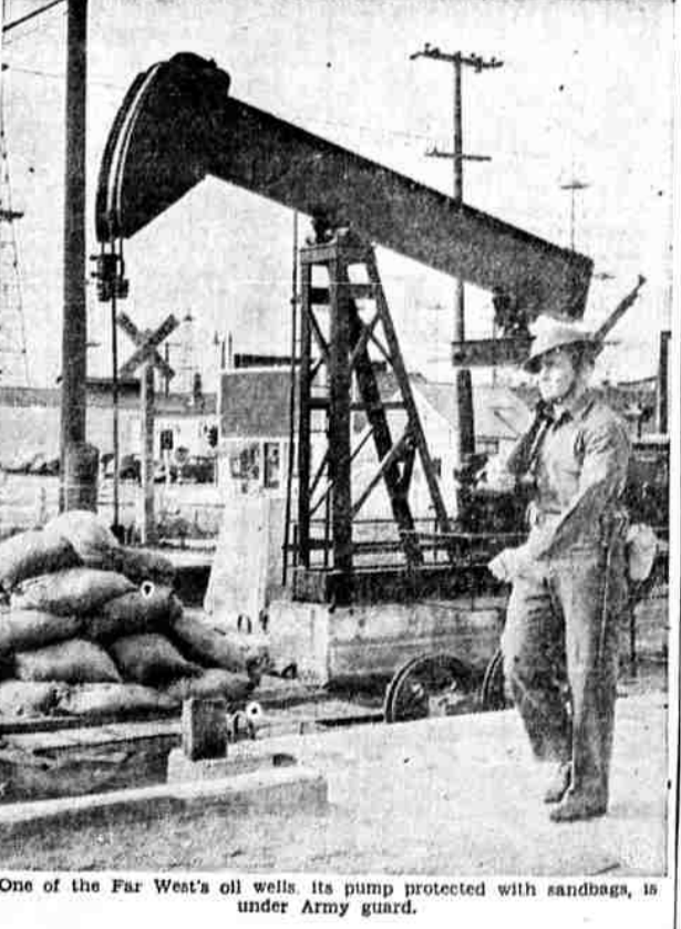
One of the Far West's oil wells, its pump protected with sandbags, is under Army guard.