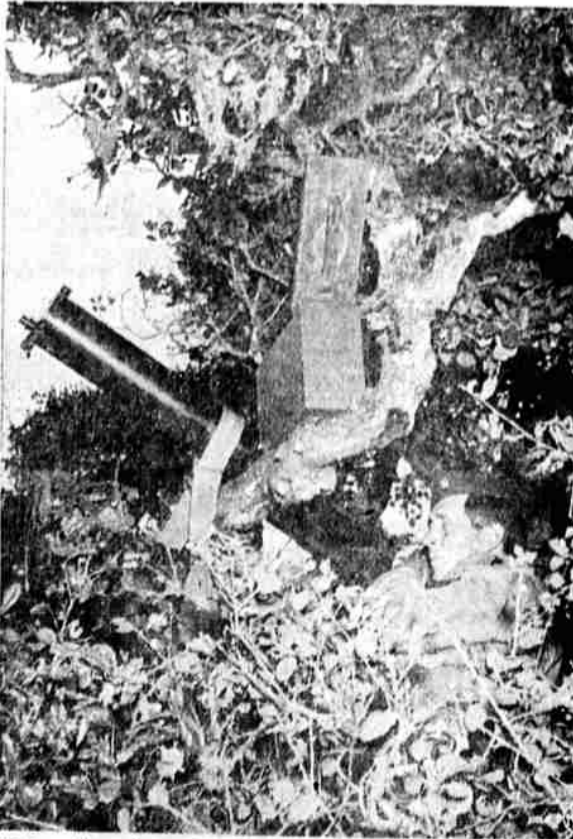
This mobile anti-aircraft machine gun—quickly moved and in firing position—is one of the many Pacific Coast defense units on the alert for any invasion by sea or air.

Dec. 21, and one with the San Diego Bulldogs, set for the Sunday following, have been cancelled. Officials said they were called off because of army regulations.