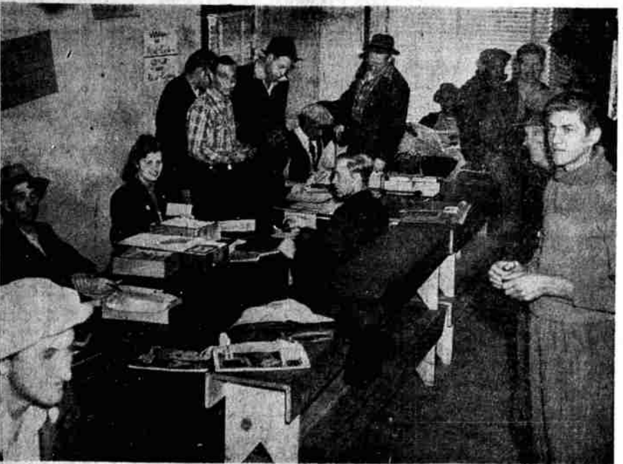
REGISTRATION DESK —Registration desk for striking AFL millworkers at Weed, Calif., lists the names of men for picket duty, woodcutting chores, etc., as the seven-week-old shutdown continues at the Long-Bell Lumber company. The above shot was taken in the Moose club, headquarters for local union 2907.