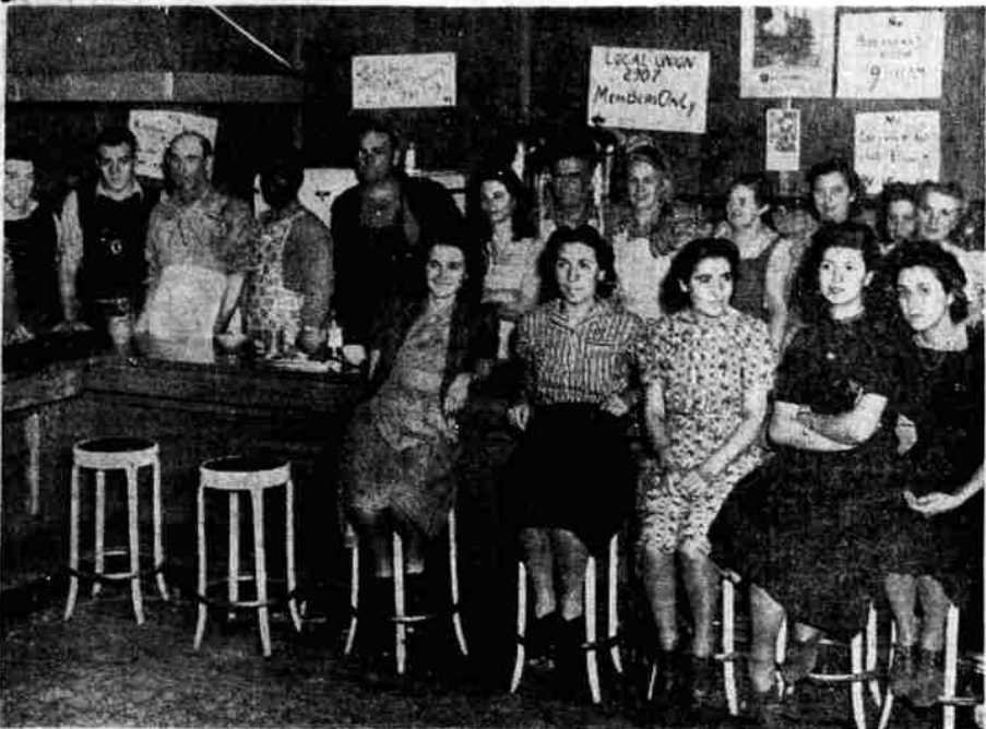
SOUP KITCHEN —A contemporary phenomena in the American way exists at Weed today as a socialized form of food and clothing distribution handles the needs of striking workers and their families. Above, the kitchen force gathers for a picture in a converted cafe which local 2907 has taken over for its use. Negroes, Italians and southern whites, bulk of Weed's population, constitute a race mixture which has thus far not been divided by strike tension.