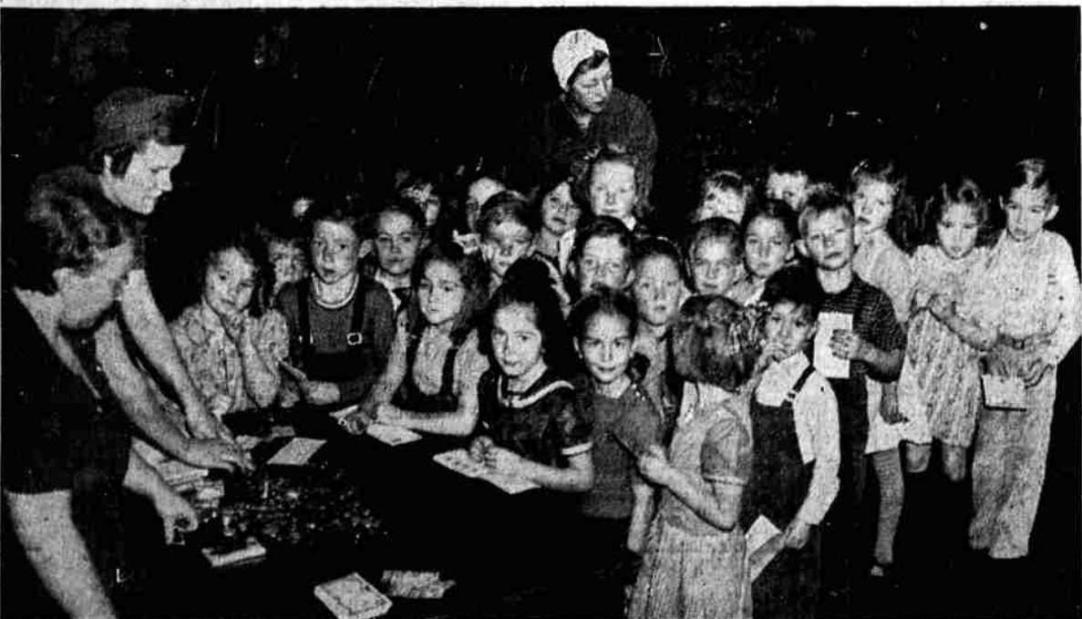
BIG STAMP DEAL —Children of Mills school last week bought $178 worth of defense savings stamps—the biggest sale made at any of the schools of the city so far. It was the third Monday sale at Mills school. Stamp purchases have increased each time. The youngsters are here shown gathered around the stamp desk.