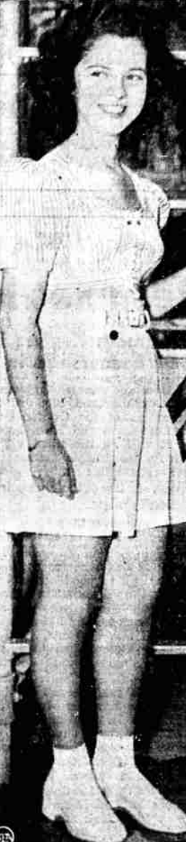
Little hard to believe, but it's Shirley Temple—looking all of her 14 years—vacationing at Pa'm Springs, Calif.