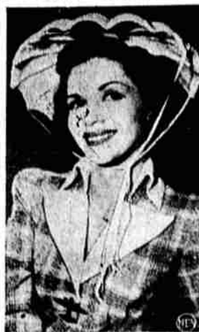
White wool parachute hat tops off Actress Carole Bruce's beige and brown plaid coat dress with copper airplanes.