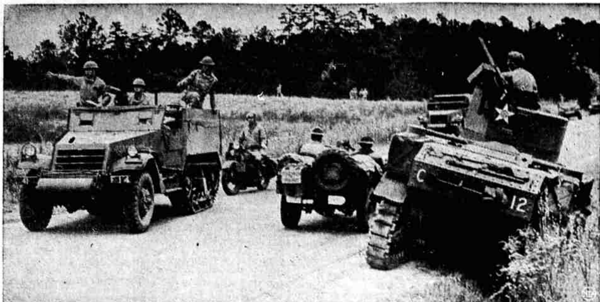
Here is the U. S. Army's mechanization situation summed up in one big panzer picture. Left to right, an armored car, motorcycle, jeep reconnaissance car and a tank pause in passing during maneuvers near Salem Crossroads, S. C.