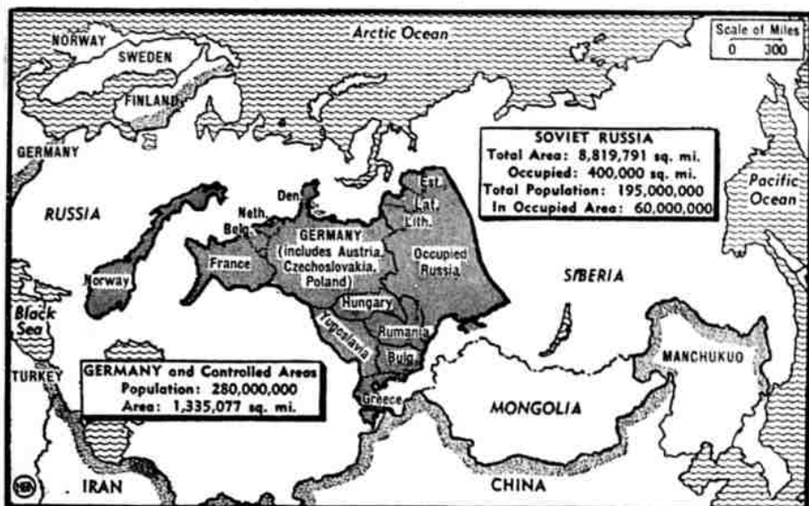
Germany, conqueror of all or part of 18 nations since 1938, still only holds territory equal to 15 per cent of vast Soviet Russia. Map shows how Nazi-held area, including occupied section of Russia, would fit in the U. S. S. R. German-controlled population, however, exceeds Russia's by about 85,000,000.