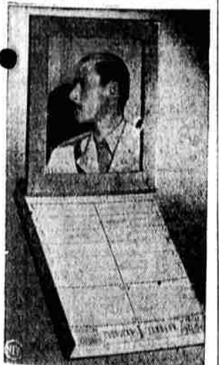
THIS handsome desk accessory answers a two-fold purpose. The pad is divided into the hours of a business day with plenty of room for notes and telephone numbers. The inside of the cover provides space for HIS or HER photo. The case is of brown or tan leather—gold tooled.