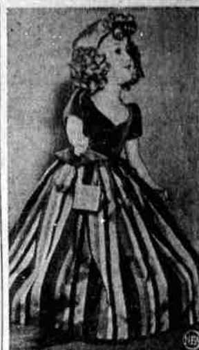
"Most typical of all toys, as far back as history looks, is the doll." This "Glamour Doll" is up-to-date, all-American in her native, modern dress.

The cares and burdens that must be laid on all our shoulders in this war would pale before the inferno that awaits us should we lose.—Joseph Goebbels, German propaganda chief.