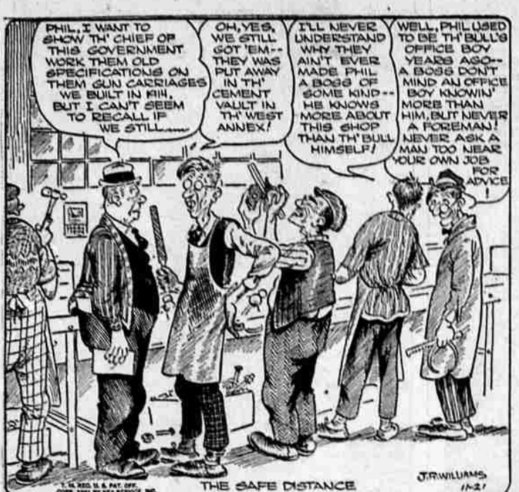
THE SAFE DISTANCE