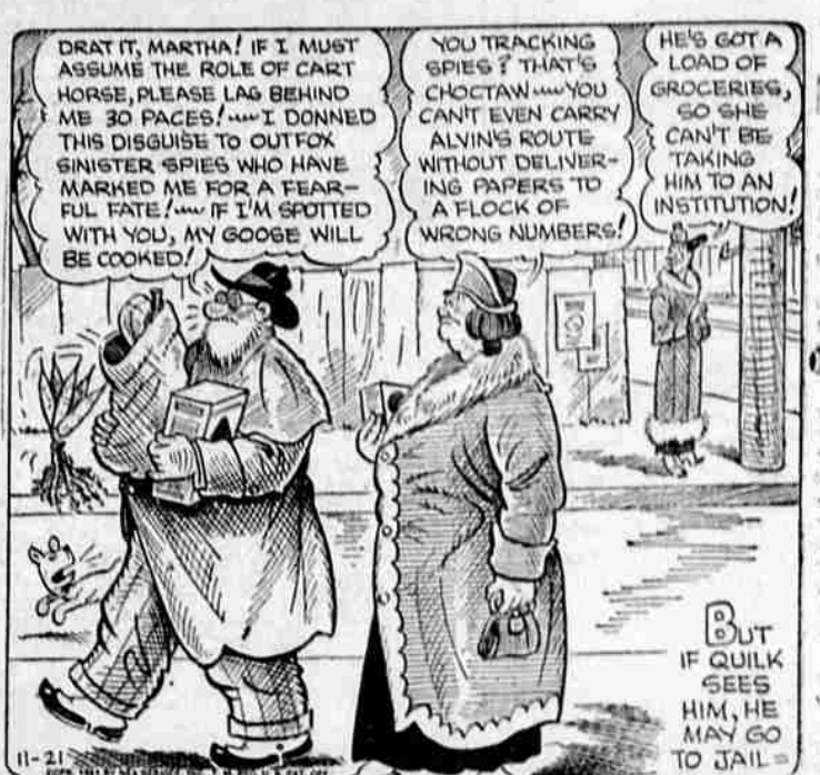
BUT IF QUIRK SEES HIM, HE MAY GO TO JAIL!