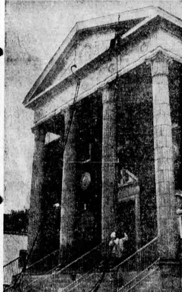
FACE WASH —Workmen are here washing the classic face of the Elks temple.