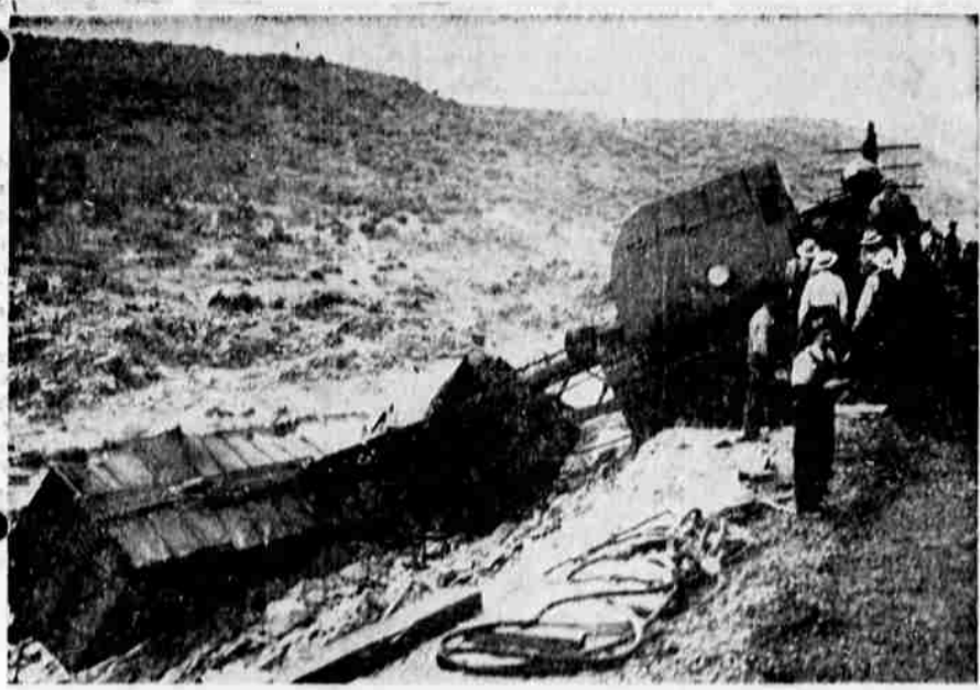
TRAIN WRECK —L. E. Price of Klamath Falls took this picture south of Dunsmuir, showing a Southern Pacific wrecker outfit in the ditch. It went over when a boxcar swung as it was being holsted back on the track.