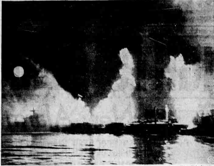
Burning amidst spectacular towers of smoke, the Canadian oil tanker Transier blazes brightly in Detroit's River Rouge as police and FBI agents sought the reasons for explosions aboard her which caused the death of two. A full load of 750,000 gallons of gasoline was destroyed.