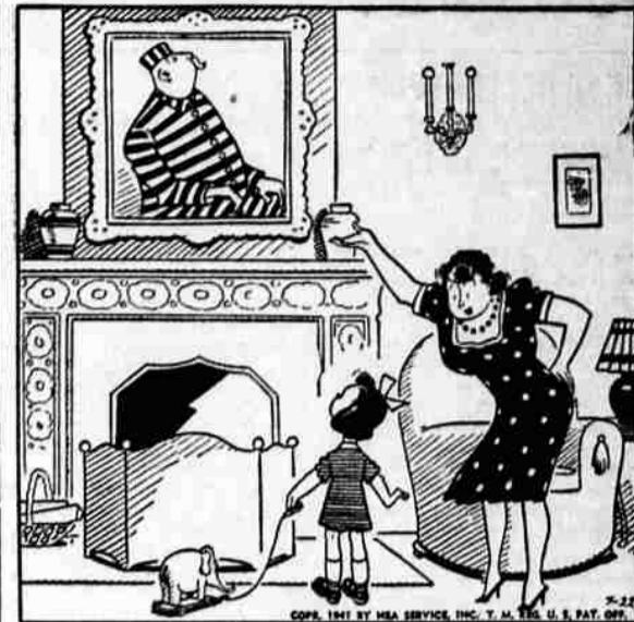
"That's your father when he thought he was an income tax expert!"