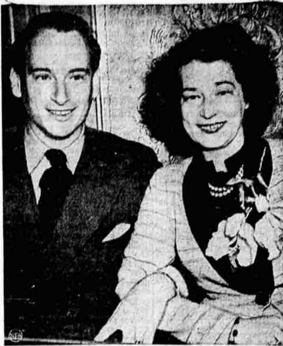
Current royal rumor in Europe is that Hitler plans to put Prince Louis Ferdinand, grandson of the late ex-tsar and former Ford worker in U. S., on the throne of Russia, if Stalin is overthrown. The six-foot prince is pictured with his wife, Grand Duchess Kira, daughter of Grand Duke Cyril, one-time pretender to Russian throne.