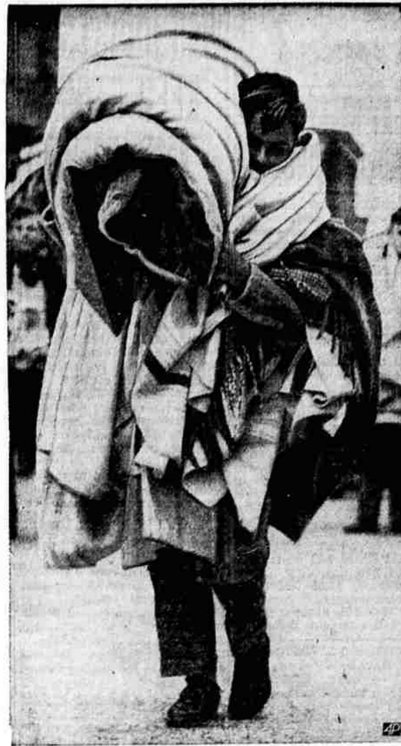
NEW BRITISH CUSTOM —Bundled up in bedding, a Wellington (England) college student on his way to an air raid shelter shows how the war seems to have suspended "for the duration" any idea that one must sleep always in a stationary bed.