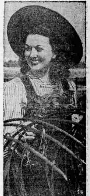
FARM GIRL —Just a little farm girl at heart, complete with a huge straw hat, striped shirt and overalls, a hayfield and a rake, is Ginny Simms, singer, who has just bought herself a ranch near Fresno, Cal., her childhood home.