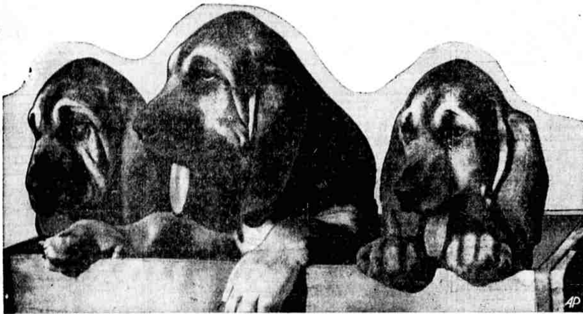
BLOOD WILL TELL IN THESE BLOODHOUNDS —At nine weeks, these droopy-eyed bloodhound pups give little indication of the firmness with which they'll do their duty later. They're recruits with the New South Wales police force in Sydney.