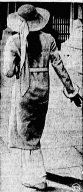
Seen outside Buckingham Palace in London the other day was this feminine getup. Maybe it's the rationing of clothing or something.