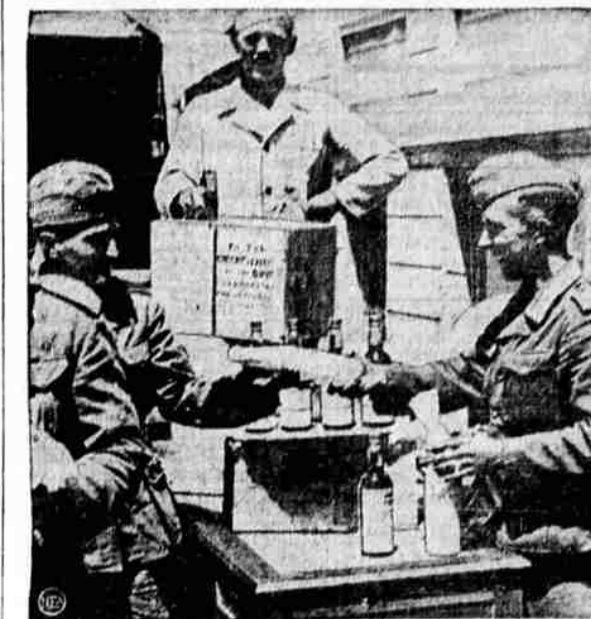
"To the gallant fighters of the B. E. F. Presented by the Federation of Vine Growers Cooperatives of the Isle of Samos, Samos—Greece." That's the stenciled lettering on these wine cases, contents of which now invigorate Germans somewhere in Greece.