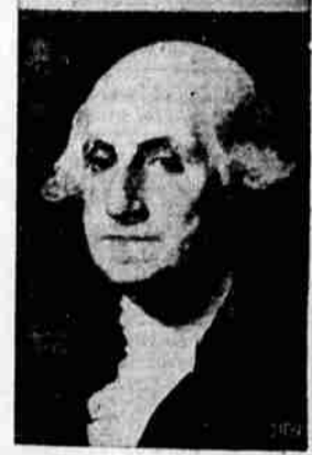
This valuable portrait of George Washington, painted by Gilbert Stuart, famous early American artist, looks bright and new, bottom, after a cleaning revealed it to be worth "hundreds of thousands of dollars." It was found as pictured at top in dusty basement of a Baltimore art gallery.