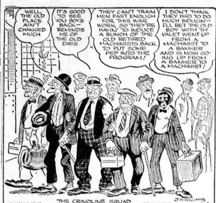
THE CRINOLINE SQUAD