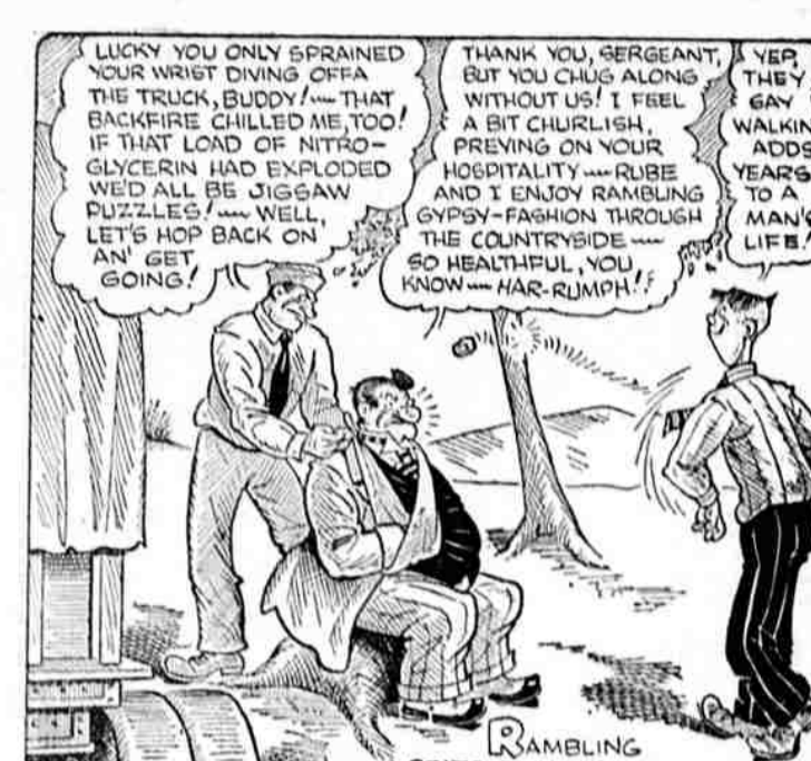
RAMBLING BEATS SCRAMBLING