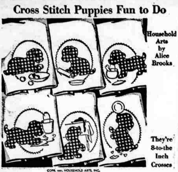
HOUSEHOLD ARTS BY ALICE BROOKS

Ask for FREE COLOR CARD GENERAL PAINT CORPORATION 515 MAIN