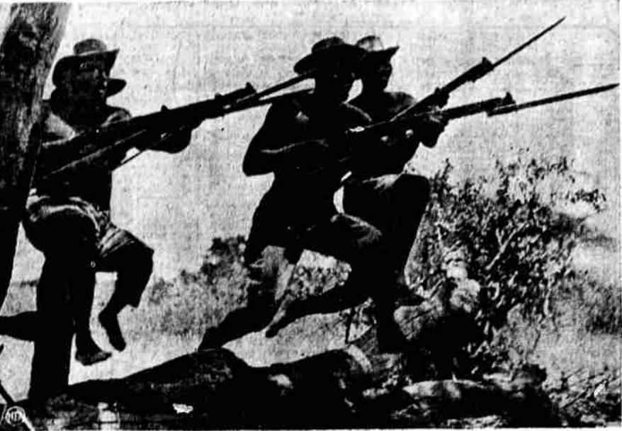
Take a look at these members of the King's African Rifles and you'll understand why Italian East Africa has now become plain east Africa. New picture of British colonialists from Kenya just arrived in America.