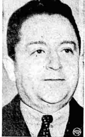
Arthur Bliss Lane, American minister to Belgrade, stays with Yugoslav government as that nation's leaders seek safety in mountains.