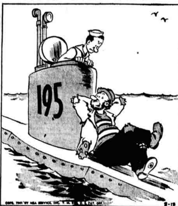
"Say, pal, will ya tip me off when we get to Guam?"