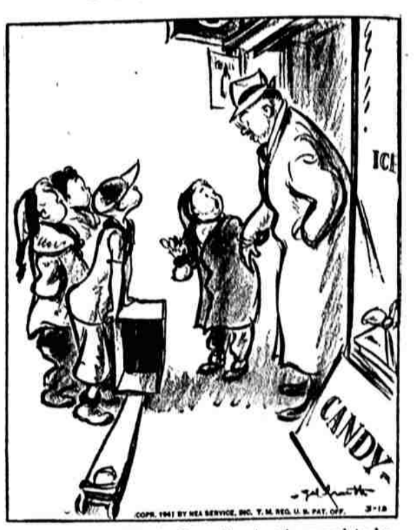
"These are my friends, Pop—they just happened to be walking past."