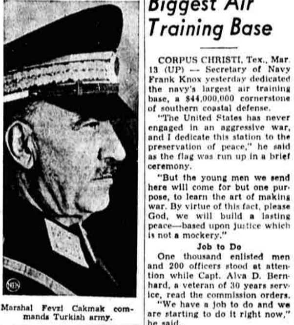
Marshal Fevzi Cakmak commands Turkish army.