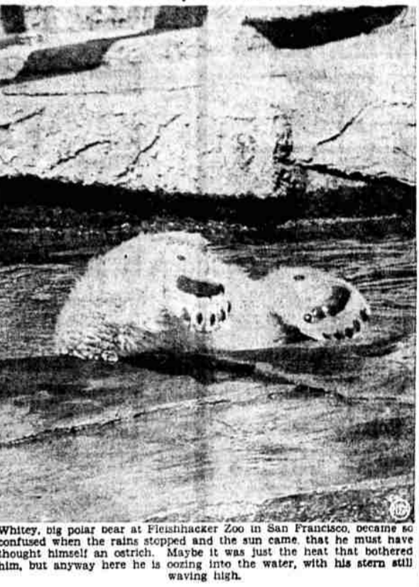
Whitey, big polar bear at Fleishacker Zoo in San Francisco, became so confused when the rains stopped and the sun came that he must have thought himself an ostrich. Maybe it was just the heat that bothered him, but anyway here he is cooing into the water, with his stern still waving high.