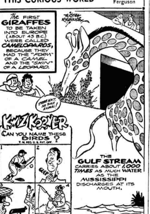
ANSWER: 1, bunting; 2, swallow; 3, robin; 4, kingfisher.