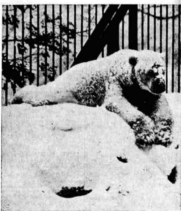
As blizzard swept northeastern U. S., happiest citizen was this polar bear at the Philadelphia zoo.