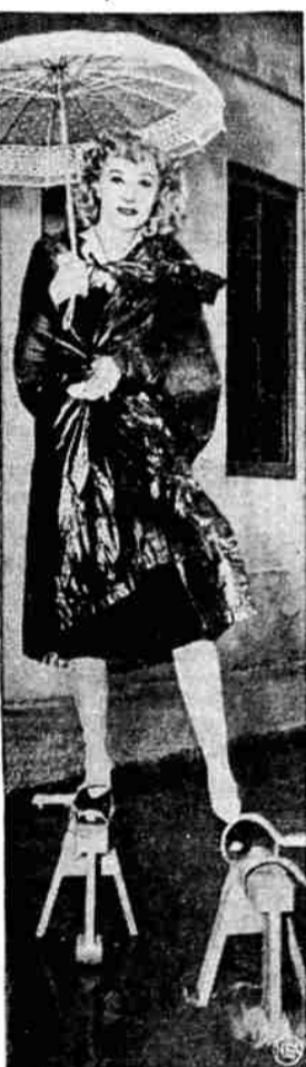
When it rains in California movie stars behave strangely, and so here is Una Merkel trying out a new type of water still, she'd have us believe.