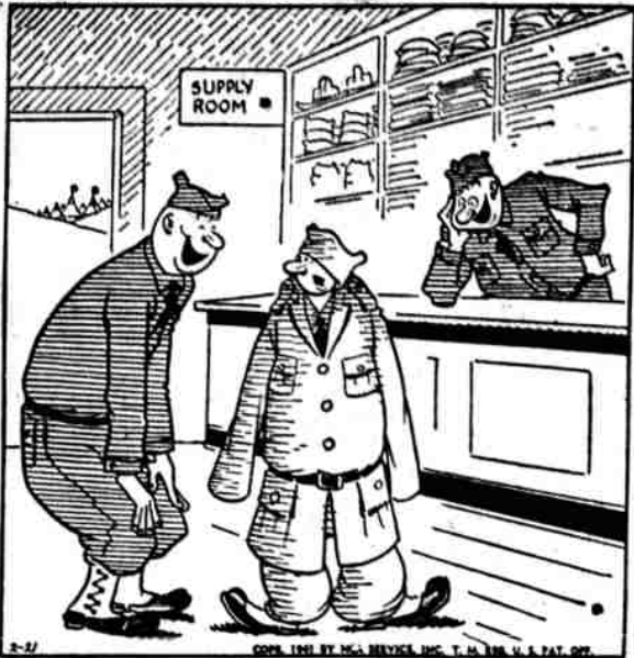
"I made the mistake of stealing his girl back home."