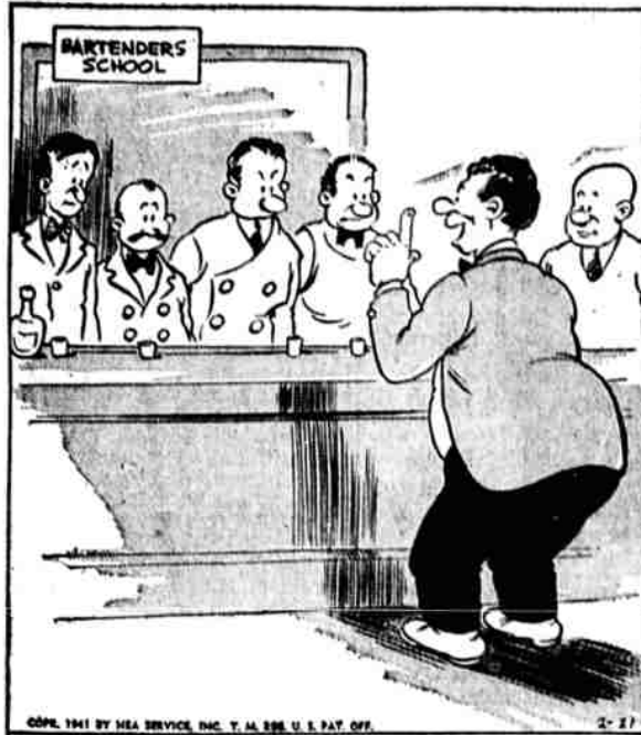
"All right, Otto—now tell the class what to do should a customer start crying."