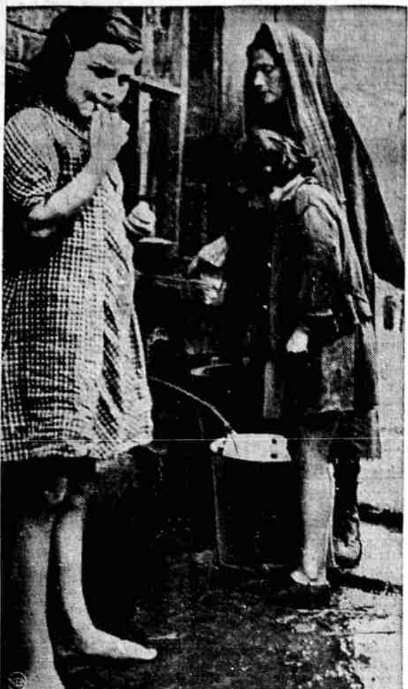
Children wait in line to get a pail of water at a public fountain in Lublin. A pail costs one phennig. Entire sections of the great Polish industrial city now have no water or sewage pipes.