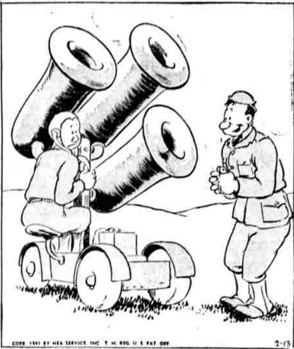
"Got any hot jive on that thing?"