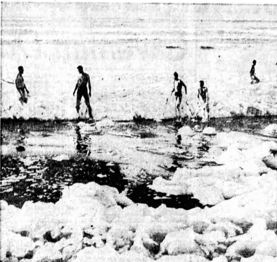
Guess again, mister. These bathers aren't showing that they can take it by pushing through snow and ice for a dip. The snow-like drifts are nice warm ocean foam, whipped to a froth by recent storms and high breakers along the Southern California coast. Here, at San Diego, bathers get a "bubble bath" from the foamy substance, known technically as spindrift.