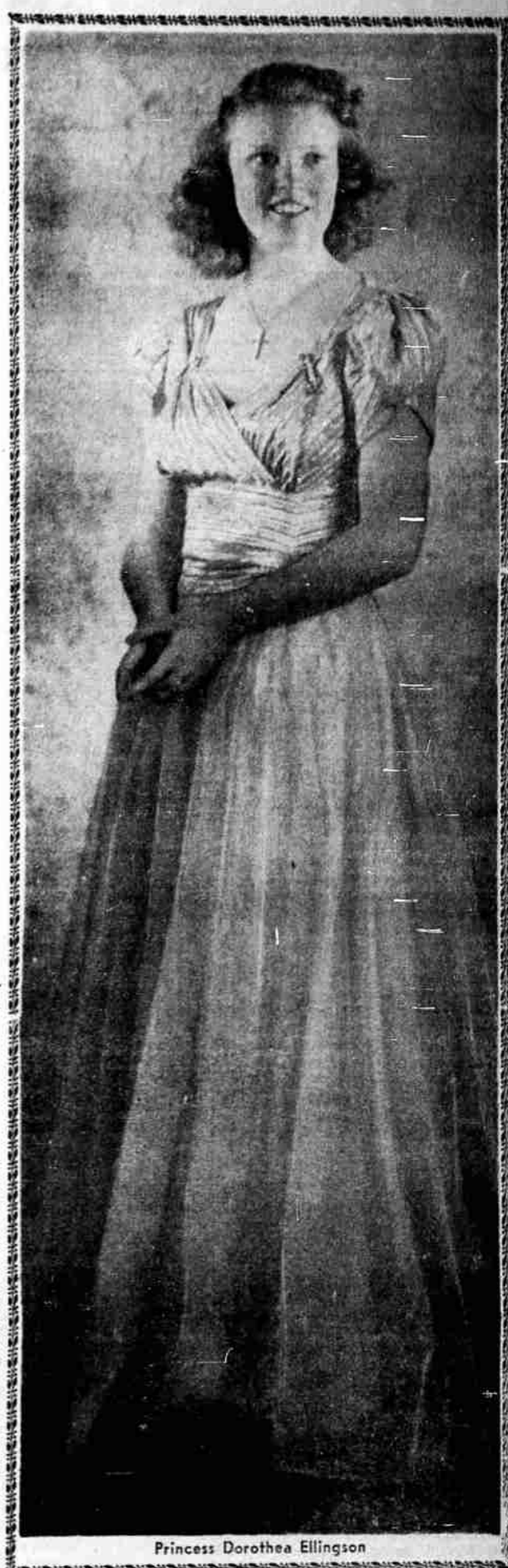
Princess Dorothea Ellingson