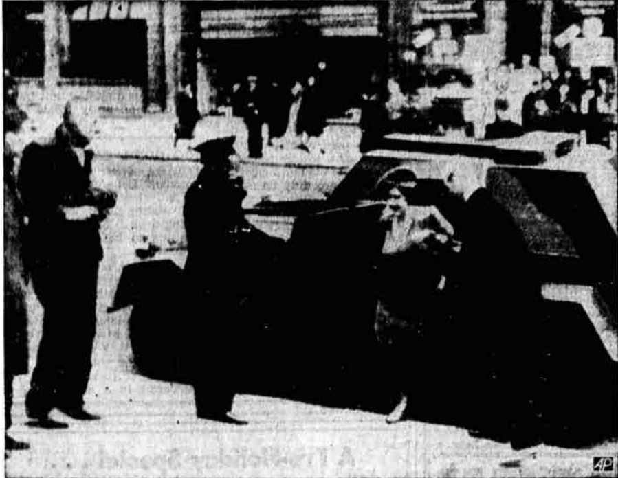
Queen Elizabeth is saluted by her chauffeur as she alights from her armored car to open an exhibition of the work of men disabled by war. The queen now uses the car for her inspection visits in bombed London. This picture was radioed from London to New York.