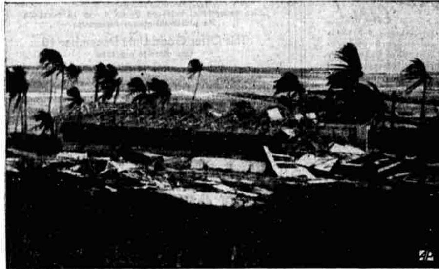
This is the first picture to be received in the United States of the damage caused by a typhoon on the island of Guam, naval station and mid-Pacific base of Pan American Airways. Property damage was heavy and five natives lost their lives.