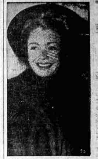
Constance Bennett, film actress, was all smiles after she was granted a divorce from the Marquis de la Falaise de la Coudraye in Reno.

Had that Rumanian quake happened in England Hitler would have lost little time claiming it as his new secret weapon.