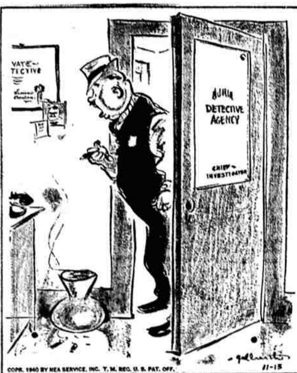
"Hey! Someone walked off with my water jug!"