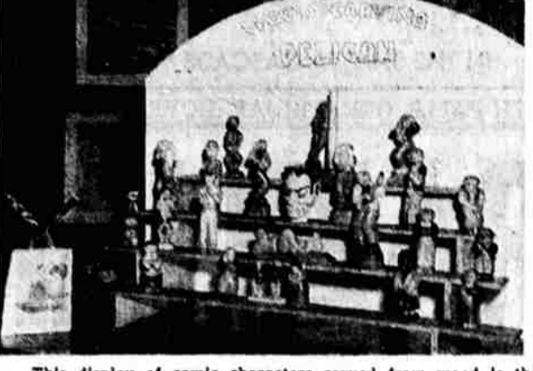
This display of comic characters carved from wood is the work of pupils at Pelican school, on display for National Art week at Fremont school.