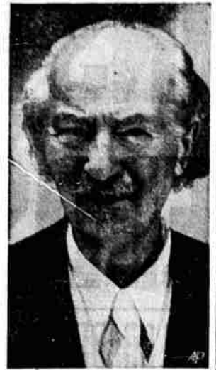
JOURNEY—When his strength returns, Jan Faderewski, now in Lisbon, will continue on to U.S. to make his home. The famous Polish pianist will be 80 years old Nov. 6.