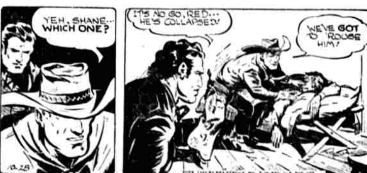
BY HAROLD GRAY