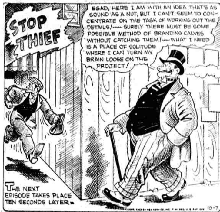
THE NEXT EPISODE TAKES PLACE TEN SECONDS LATER