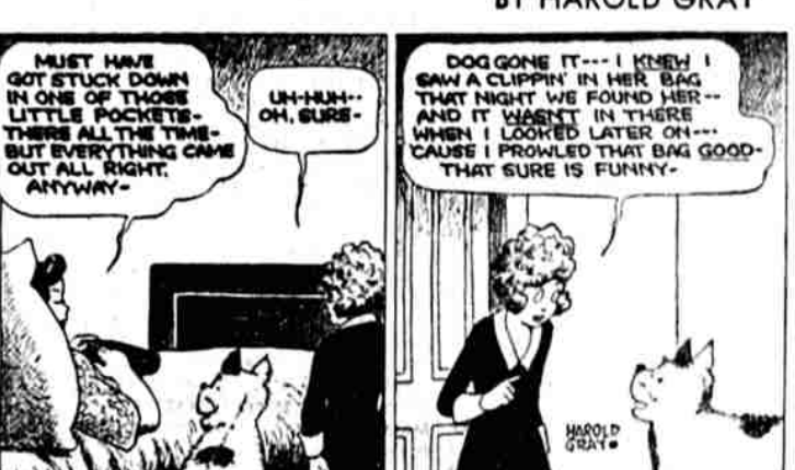
BY HAROLD GRAY