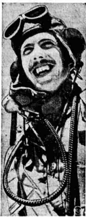
The face of this R. A. F. bomber pilot gives his own answer to the British Army's slogan-question: "Are we downhearted?" Stationed in Egypt, he's pictured just before taking off to harry invading Italians.