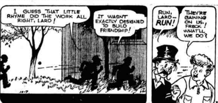
FRECKLES AND HIS FRIENDS