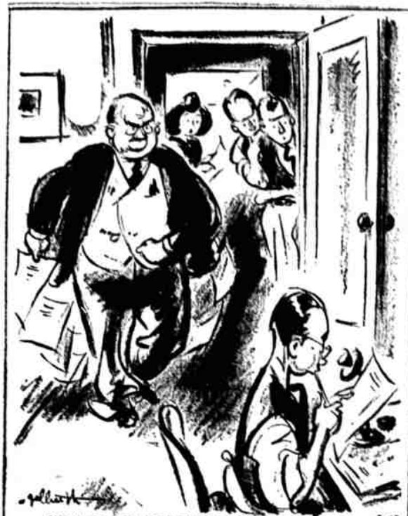
"We should have tipped that new man off that this is the boss's day to take a crack at everybody in the place!"