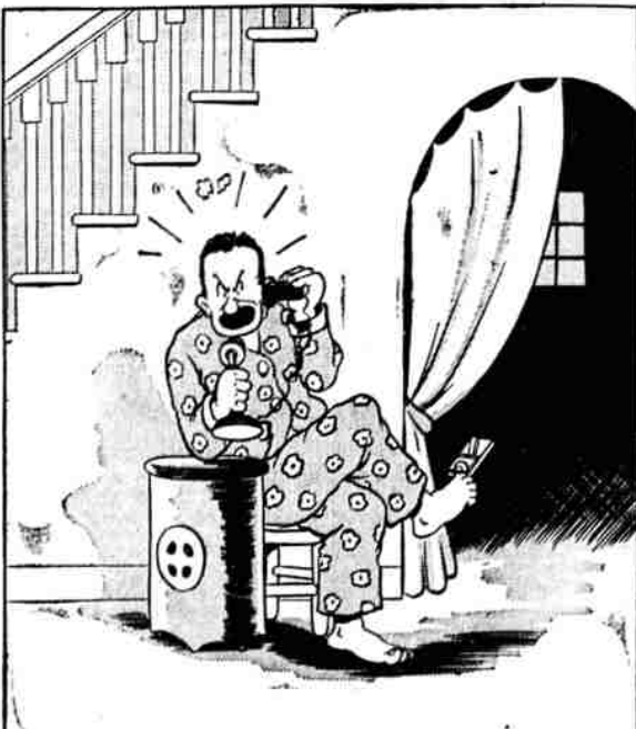
"Say, I thought that gadget you sold me was for catching mice!"