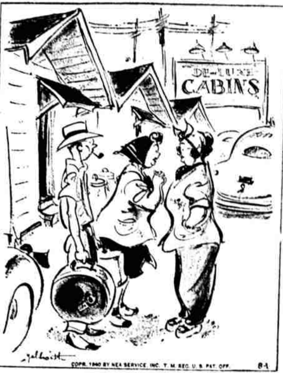
"John wanted to stop at a hotel, but I just love to go primitive like this once in a while, don't you?"