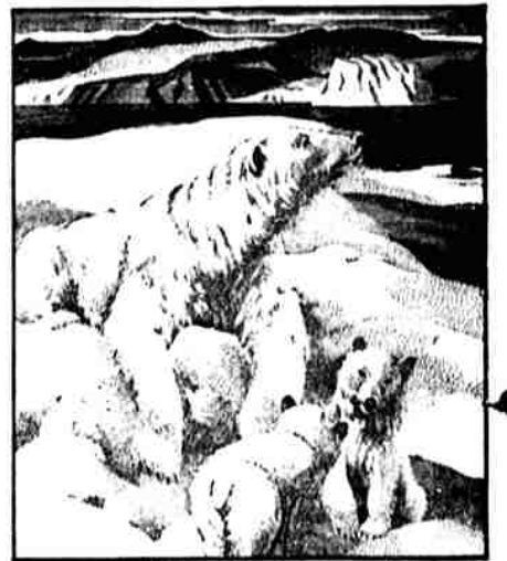
Consequently, she is careful to keep them against a background of snow—a fine example of Protective Blending