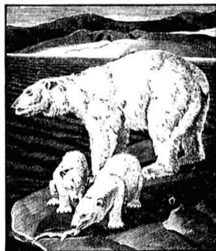
Mother bear is too wise to expose her young to the hunter, in sharp relief against a dark background like this