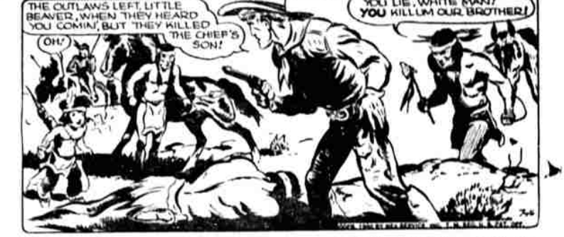
BY HAROLD GRAY