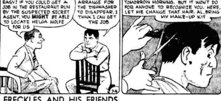
FRECKLES AND HIS FRIENDS