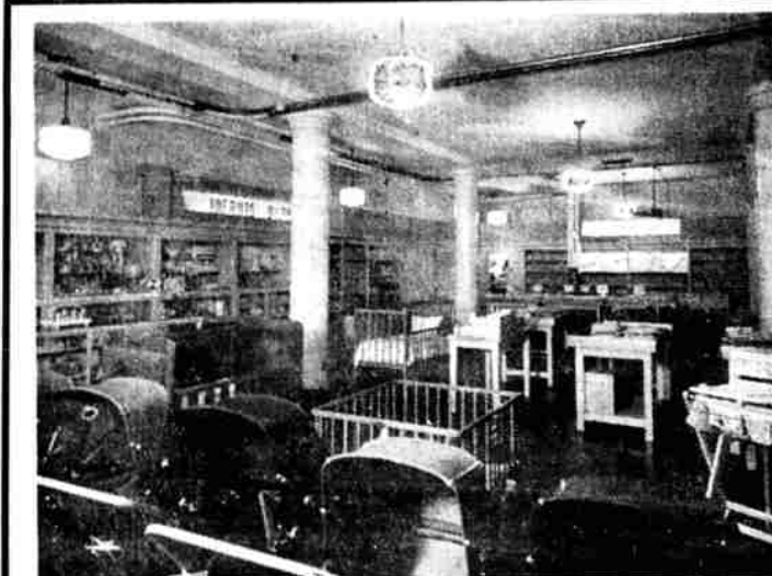
This is a view of Penney's new Infants' and Foundation departments.