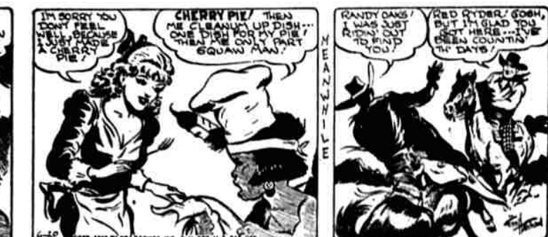
BY HAROLD GRAY