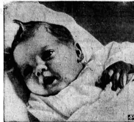
LITTLE QUEEN—No, she's just a princess, and a precarious princess, too. Just a few days before she was born, Adolf Hitler invaded her native Denmark and turned the kingdom into a protectorate. She's Princess Margrethe, daughter of Crown Prince Frederik, was four weeks old when photographed on day she was christened in Copenhagen.