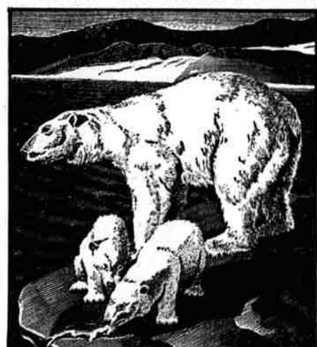
Mother bear is too wise to expose her young to the hunter, in sharp relief against a dark background like this