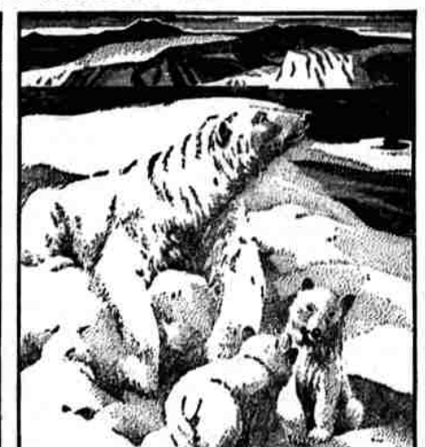
Consequently, she is careful to keep them against a background of snow—a fine example of Protective Blending