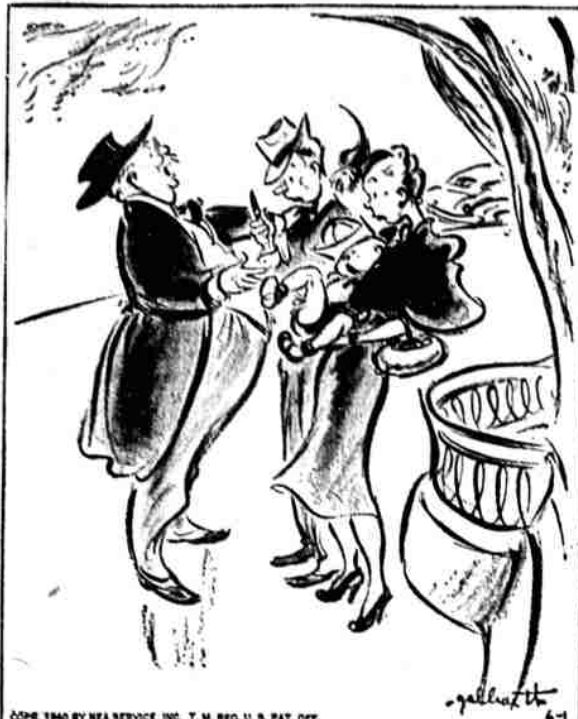
"If the voters send me back to Washington, I can do some big things for this little fellow!"

the British embassy had been the state department rule requiring British flyers to take over the planes at the Canadian border. Flyers needed at the front had to be kept at this ferry service.