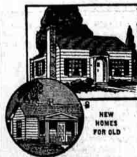
NEW HOMES FOR OLD

You've seen in home magazines what can be done with outdated, inconvenient houses . . . An alteration in line, exterior changes, interior improvements can work wonders . . . And also raise the resale value of your home. Let us plan with you to change your old home into a new one . . . a smart one!