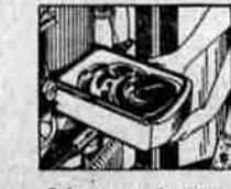
Polarex meat saver. Permits cold storage of steaks, fowl, roasts, game at moderate temperatures.