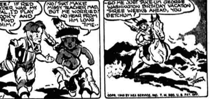
BY HAROLD GRAY